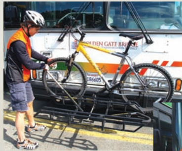
Raise handle to the brakes.