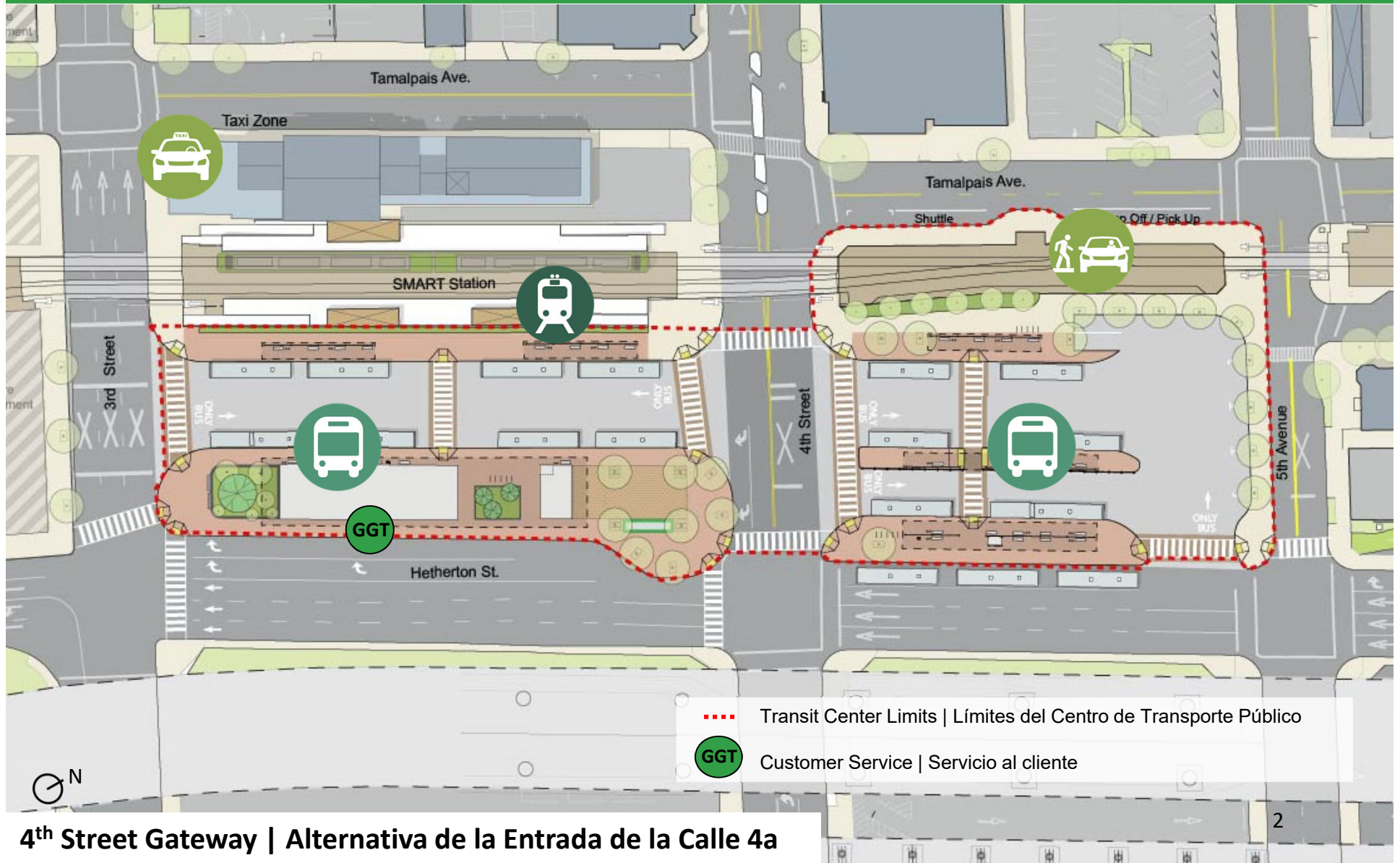
4 th Street Gateway | Alternativa de la Entrada de la Calle 4a